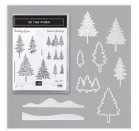
In The Pines Bundle - 155182