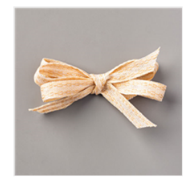
3/8" (1 Cm) Embroidered Ribbon - 153554