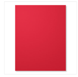
Real Red 8-1/2" X 11" Cardstock -102482