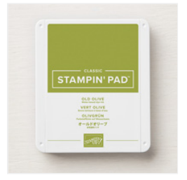
Old Olive Classic Stampin' Pad -147090