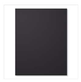
Basic Black 8-1/2" X 11" Cardstock 121045