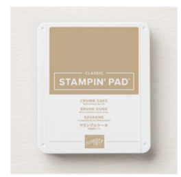
Crumb Cake Classic Stampin' Pad - 147116