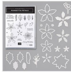
Poinsettia Petals Bundle (English) - 155148