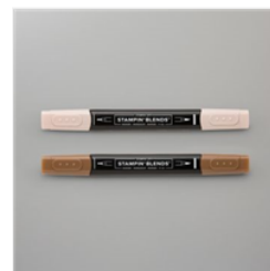
Bronze & Ivory Stampin' Blends Combo Pack - 157040