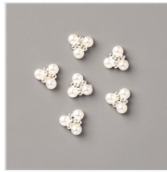
Beaded Pearls - 153534