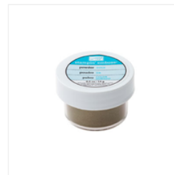
Gold Stampin' Emboss Powder - 109129