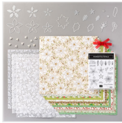
Poinsettia Place Suite Collection (English) - 155109

marcie@marciebesecker.com www.marciebesecker.com