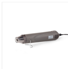
Heat Tool - 129053