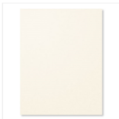
Very Vanilla 8-1/2" X 11" Cardstock - 101650