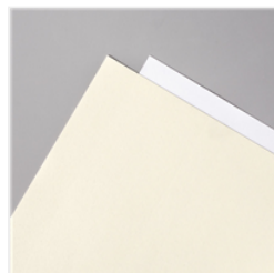
Very Vanilla 8-1/2" X 11" Thick Cardstock - 144237