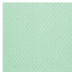
Tasteful Textile 3D Embossing Folder - 152718