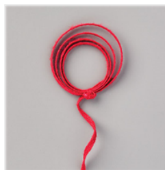
Real Red 3/16" (4.8 Mm) Braided Linen Trim - 153546