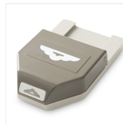
Scalloped Tag Topper Punch - 133324