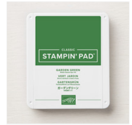
Garden Green Classic Stampin' Pad - 147089