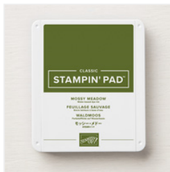
Mossy Meadow Classic Stampin' Pad - 147111