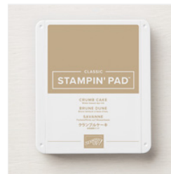
Crumb Cake Classic Stampin' Pad - 147116