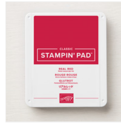
Real Red Classic Stampin' Pad - 147084