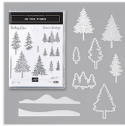
In The Pines Bundle - 155182