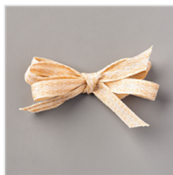
3/8" (1 Cm) Embroidered Ribbon - 153554