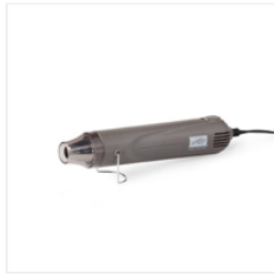
Heat Tool - 129053