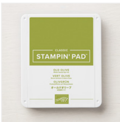
Old Olive Classic Stampin' Pad - 147090