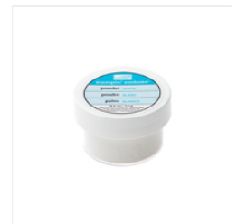
White Stampin' Emboss Powder - 109132