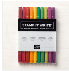
Regals Stampin' Write Markers - 147155