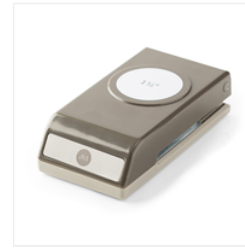
1-1/2\" (3.8 Cm) Circle Punch - 138299