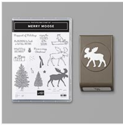
Merry Moose Bundle - 153015