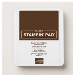
Early Espresso Classic Stampin' Pad - 147114