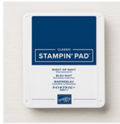
Night Of Navy Classic Stampin' Pad - 147110