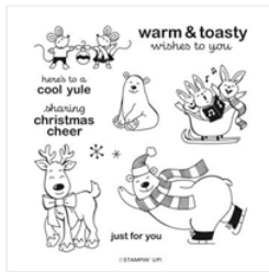
Warm & Toasty Cling Stamp Set - 152615

marcie@marciebesecker.com www.marciebesecker.com