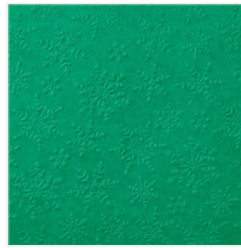
Winter Snow Embossing Folder - 153577