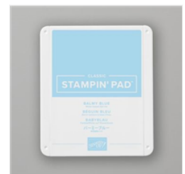
Balmy Blue Classic Stampin' Pad - 147105