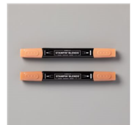
Cinnamon Cider Stampin' Blends Combo Pack - 153105