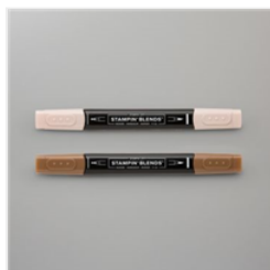
Bronze & Ivory Stampin' Blends Combo Pack - 157040