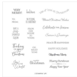
Itty Bitty Christmas Cling Stamp Set (En) - 150513