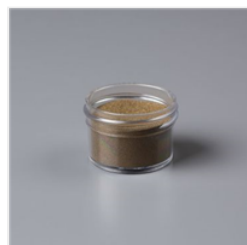
Gold Stampin' Emboss Powder - 109129