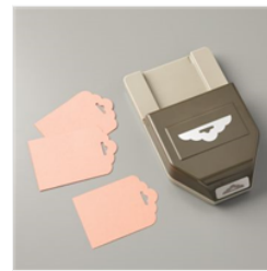
Scalloped Tag Topper Punch - 133324