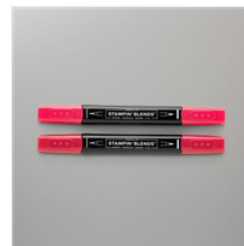
Real Red Stampin' Blends Combo Pack - 154899