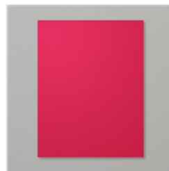
Real Red 8-1/2" X 11" Cardstock - 102482