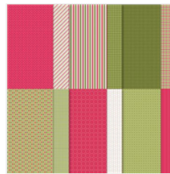
Heartwarming Hugs Designer Series Paper - 153492