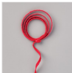
Real Red 3/16" (4.8 Mm) Braided Linen Trim - 153546