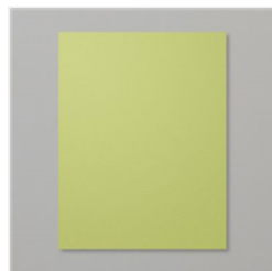
Pear Pizzazz 8-1/2" X 11" Cardstock - 131201